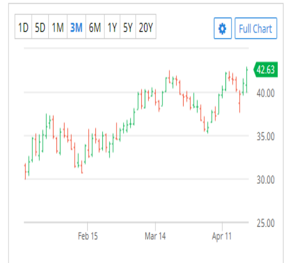
Crude Oil WTI May '16 (CLK16)